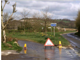
Flooding at Middle Assendon.