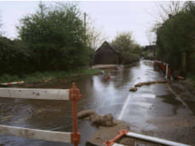
Flooding and road closure at Lower Assendon