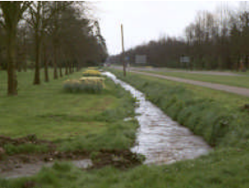
The flow of the Spring along the Fair Mile