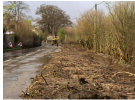
Digging out the ditch in Lower Assendon.