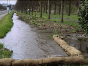
The flow of the Spring in the Fair Mile and Northfield End.