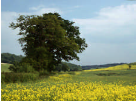
The source of the Assendon Spring at Stonor.